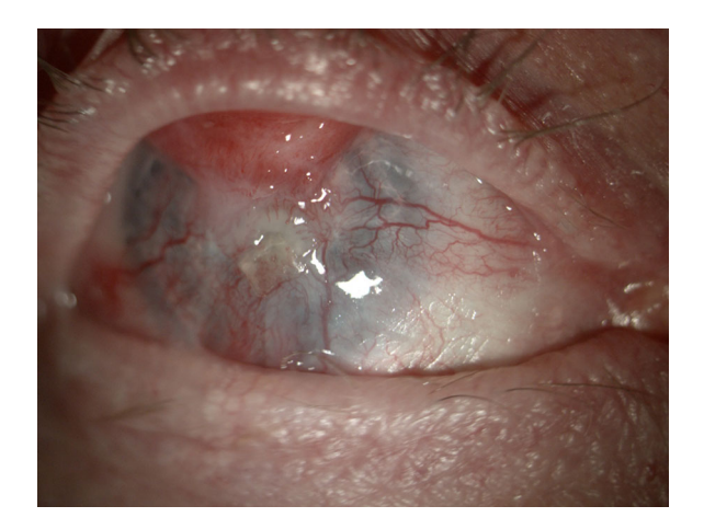
Fig. 2 Eye after KLAL procedure for LSCD due to Lyell's syndrome