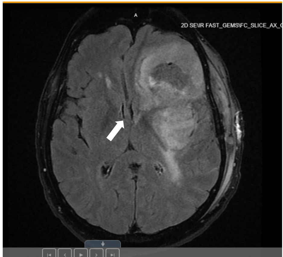
FIGURE 2: MRI of the brain demonstrates post partial resection of the large left frontotemporal tumor, with decreased peripheral contrast enhancement and decreased mass effect, resulting in diminished midline shift from left to right (denoted by a white arrow), now measuring 9 mm, compared to 13 mm preoperatively.

Postoperatively, there was initial worsening of neurological deficits, specifically expressive aphasia, followed by significant improvement. On postoperative day 3, the patient developed acute onset of right-sided hemiparesis with marked aphasia. MRI of brain showed acute left posterior, frontal, and parietal infarct (Figure 3). Given the recent brain surgery and underlying malignancy, the patient was not candidate for IV thrombolysis with plasminogen tissue activator (tPA). Patient was discharged with a plan to start Stupp protocol of temozolomide and concomitant radiotherapy [6].