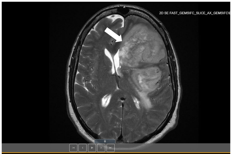
FIGURE 1: MRI of the brain reveals a large 9.5 cm infiltrating intra-axial mass in the left frontal and temporal lobe with 13 mm midline shift from left to right (indicated with a white arrow).

He was started on 4 mg intravenous (IV) dexamethasone every 6 hours to reduce mass effect and vasogenic edema. Levetiracetam (1 g/day) was also given for seizure prophylaxis. Subsequently, he underwent left craniotomy and resection of left frontal tumor. Postoperative MRI revealed partial resection of the tumor with decreased mass effect, resulting in diminished midline shift to 9 mm compared to 13 mm preoperatively (Figure 2). At this time, there was no indication of acute ischemic injury. Pathological examination confirmed GM.