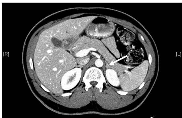
Figure 1. Adrenal mass.