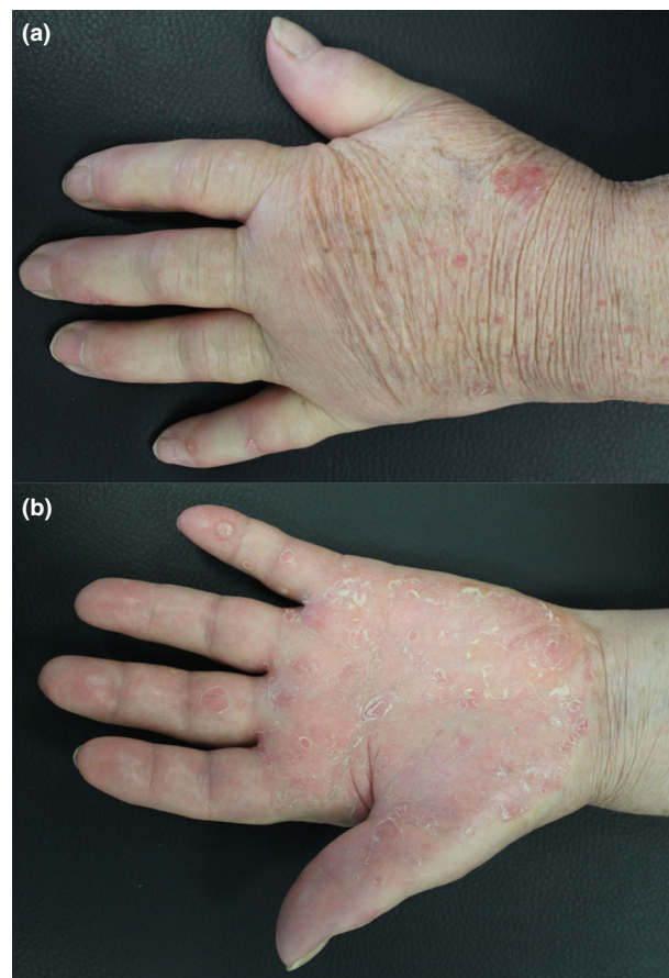
Figure 1 (a) Erythema and desquamation on the palm of left hand. (b) Oedema on the back of left hand and wrist joint.

RS3PE syndrome is characterized by symmetrical synovitis and swelling of both the upper and lower extremities. RS3PE syndrome may overlap several rheumatic disorders such as polymyalgia rheumatica, rheumatoid or psoriatic arthritis,