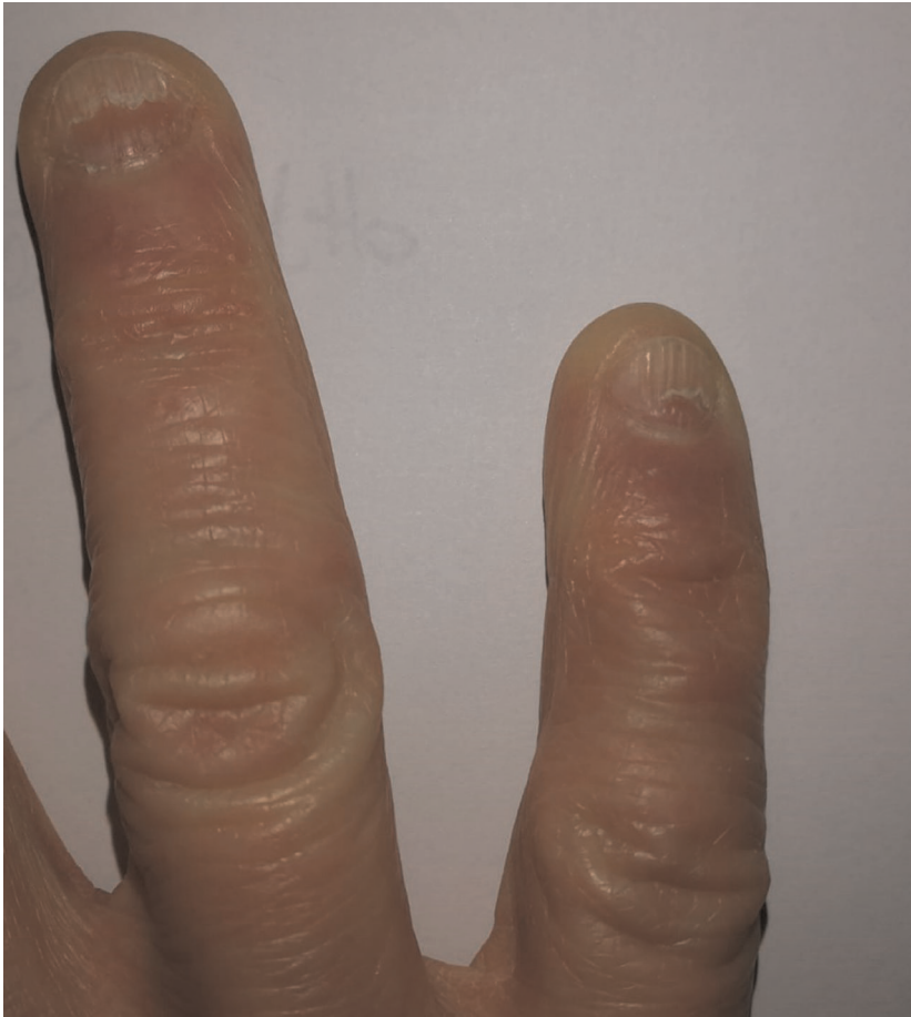
Figure 1 Pernio-like lesions on the fingers of right hand after the second dose of Pfizer-BioNTech vaccine.

At the present, only a few cases of pernio-like skin lesions induced by mRNA COVID-19 vaccines have been reported and, in particular, five cases have been observed after the Pfizer-BioNTech vaccine. 10 This case, together with those already reported in the literature, raises the question of whether the vaccine-elicited immune response could be involved in the development of pernio-like manifestations, as it has been described following COVID-19 infection.