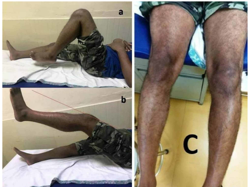
FIGURE 1: Clinical picture showing a) range of motion, b) extensor lag, and c) muscle wasting.

An X-ray of the knee was unremarkable. MRI was advised and it showed a large intratendinous cyst of size 28 x 7 x 5.5 mm with high signal intensity on T2- and PD-WI occupied in the mid half of patella tendon and gradually thinning as terminating in the bony attachment (Figure 2).