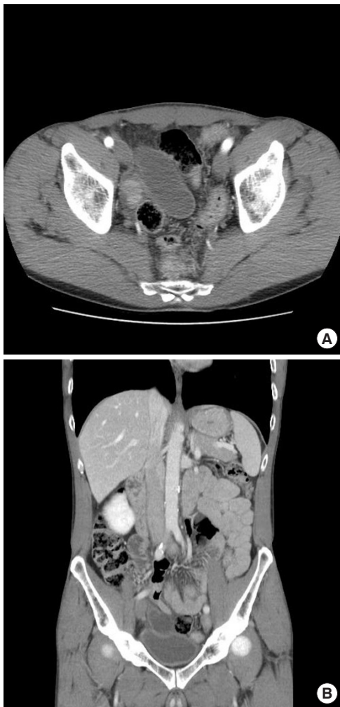
Fig. 1. Abdominal computed tomography for case 1. (A) Axial view. A 3.4-cm dilatation of the appendix with suspicious torsion and rupture of the appendiceal mucocele. (B) Coronal view. Suspicious wall defects in the appendix.

The vital signs on arrival were stable, with a blood pressure of 137/76 mmHg, heart rate of 72 beats per minute, and body temperature of 36.0°C. In the initial laboratory study, leukocytosis (15,420/μL) with elevated neutrophil segment (83.4%) and normal CRP level (0.04 mg/dL) was noted. Abdominal CT was performed and showed both suspicious appendiceal mucocele and appendicitis. We also suspected ischemic rupture with torsion of