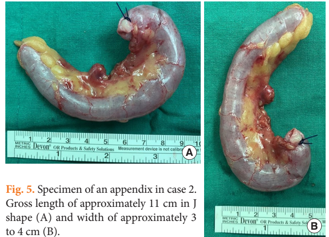
Fig. 5. Specimen of an appendix in case 2. Gross length of approximately 11 cm in J shape (A) and width of approximately 3 to 4 cm (B).