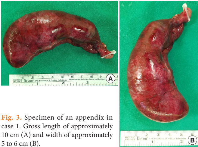
Fig. 3. Specimen of an appendix in case 1. Gross length of approximately 10 cm (A) and width of approximately 5 to 6 cm (B).