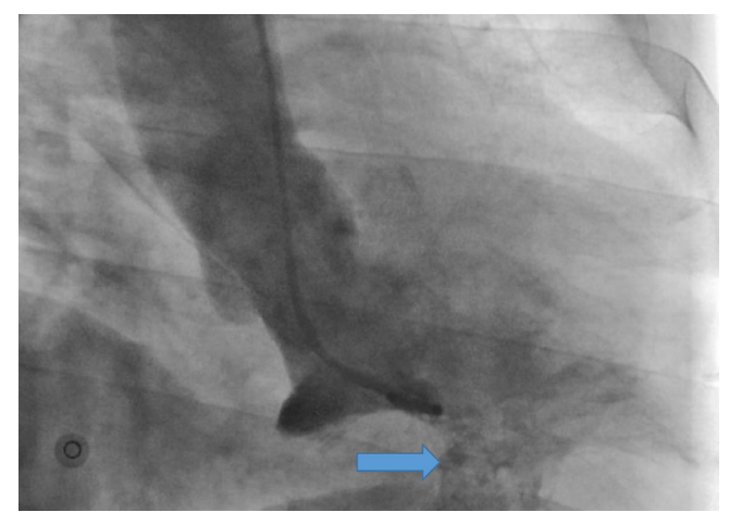
Figure 3. Right anterior oblique view of left ventricular angiography, showing a diverticulum in the posterobasal wall (arrow)

Coronary artery angiography showed normal coronary arteries, and ventriculography revealed a narrow-necked outpouching in the posterobasal LV wall with systolic contractions, suggestive of an asymptomatic huge ventricular diverticulum (Figure 3). The patient refused to undergo cardiac magnetic resonance imaging despite our recommendation.