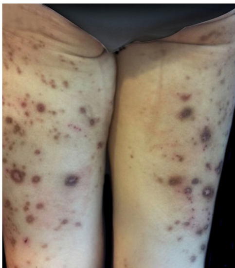
Figure 1 Clinical presentation of a 65-year-old female with generalized umbilicated, hyperpigmented, and excoriated papules and nodules.