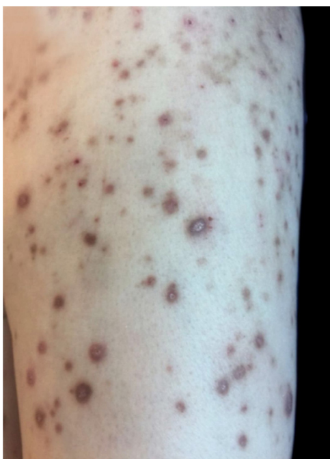
Figure 2 On magnification, a central keratotic plug is visible.

Skin biopsy showed a cup-shaped depression of the epidermis, with an overlying keratin plug containing collagen fibers, keratinous debris, and inflammatory cells on H&E stained sections. Van Gieson staining demonstrated vertically oriented collagen fibers extruding through the epidermis (Figs. 3 and 4).