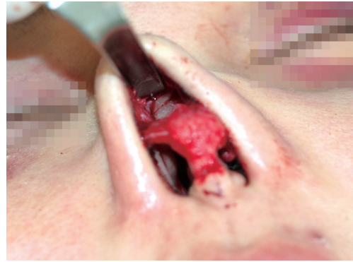
Fig. 2. Appearance during surgery. A fracture line was observed after the implant sandwiched between the fractured nasal bone segments was removed.