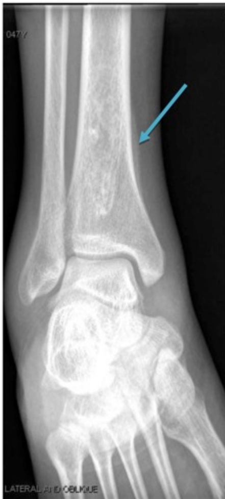
Fig. (3). Right medial tibia periostitis (blue arrow).

Our patient was also a smoker and tobacco use has been associated with positive anti-dsDNA antibodies and increased disease activity in SLE [12]. In a large cross-sectional study of healthy individuals, anti-dsDNA antibodies were not detected and ANA positivity could not be linked to either smoking or alcohol intake [13]. The increased cell death and deficient elimination of cellular debris may expose intracellular antigens to immune system and lead to autoantibody formation. In addition, the presence of autoantibodies in malignancy may represent an immune response important in eradicating the malignant cells [14].