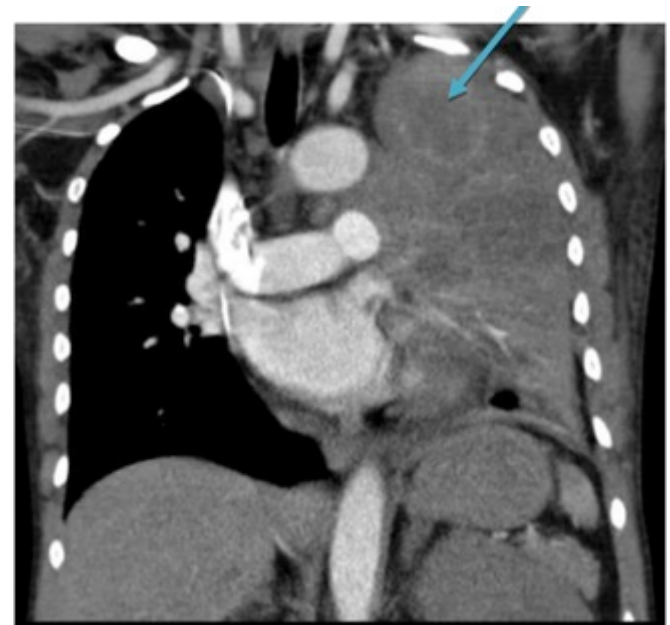
Fig. (2). Chest computed tomography shows left upper lobe mass (blue arrow).