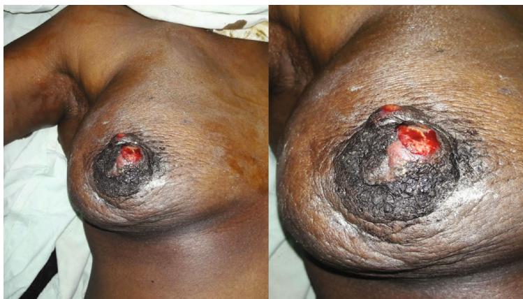
FIGURE 1: Fungating tumour with active bleeding from the erosion.

a multidisciplinary team discussion. Two weeks later, she presented with another small lesion of 0.5 cm size on the left breast skin. Excision biopsy of the lesion confirmed angiosarcoma and she underwent a left mastectomy.