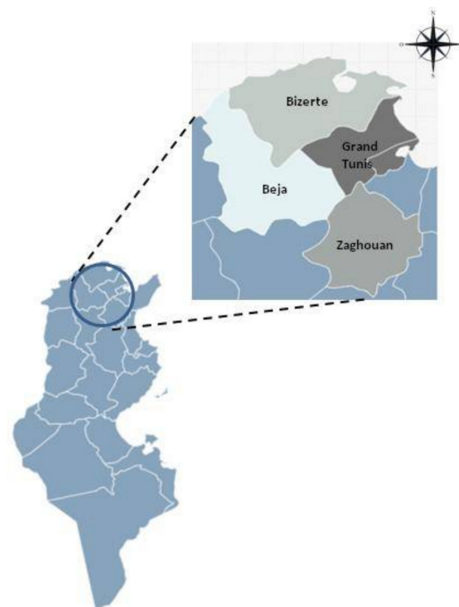
Figure 1. Location of the study area in Tunisia.

The samples were collected from four districts in the north of Tunisia (Figure 1), which were located in the sub-humid (Bizerte and Beja) and semi-arid areas (Grand Tunis and Zaghuan). This area is characterized by a typical Mediterranean climate with hot summers of up to 22 °C, and precipitation occurring in the winter, ranging from 400 to 500 mm of rainfall per year [10]. Samples were purchased from 75 randomly selected unorganized retail marketing points for dairy products during the period from March to November 2019. A total of 200 samples of cow's raw milk ( n = 40 ), artisanal fresh cheese ( n = 102 ), and ricotta ( n = 58 ) were collected. The fresh cheese and ricotta samples were made from unpasteurized cow's milk. All products were not packaged and had no indication that they had been inspected by any Tunisian organization involved in food safety. Each sample was bagged in a sterile bag and transported to the laboratory under refrigeration in a cool box.