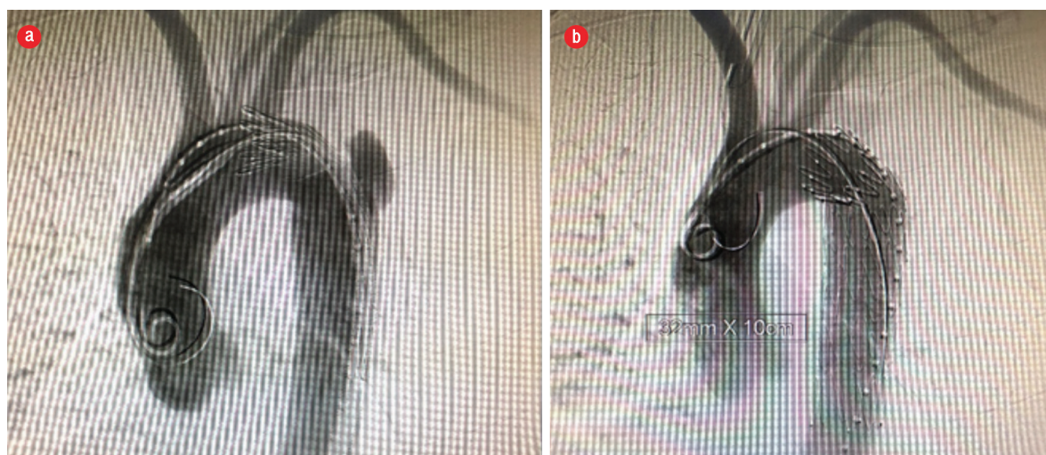
Figure 1: (a) Angiogram showing blunt traumatic aortic injury before thoracic endovascular aortic repair. (b) Completion angiogram post-thoracic endovascular aortic repair.

Data were summarized using mean, standard deviation, median, frequency, and percentage. Independent samples t -test and Mann-Whitney U-test were used to analyze parametric and non-parametric continuous variables, respectively.