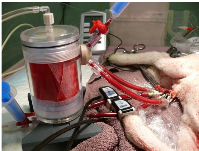
Figure 2. Miniaturized, pumpless extracorporeal lung support for premature neonates (research device, priming volume of complete circuit: \leq 20 ml) tested in a lamb model with cannulation of the umbilical cord vessels. full color online

Another development direction was the design of an intracaval, implantable membrane oxygenator, which was preclinically tested. 49 However, the overall gas transfer rates for both O 2 and CO 2 were too low, as the fiber bundles of this oxygenator were compressed by the vena cava itself, and the blood flow passed only the outer membrane fibers. Various systems for CO 2 elimination have been developed and are already in clinical use 50,51 (e.g. ILA system, Xenios AG, Heilbronn, Germany; Hemolung, ALung Technologies Inc., Pittsburgh, Pennsylvania). The oxygenators described so far are all based on hollow fiber membranes, which are currently the best solution for clinical use in terms of plasma tightness, permeability, and pressure drop. 52 Polydimethylsiloxane—a material with very good biocompatibility and oxygen diffusivity—serves as the