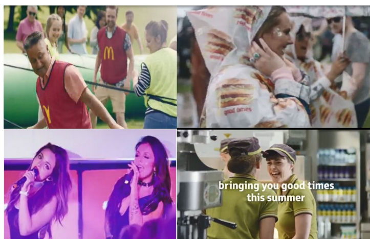
Figure 1. Stills from McDonald's 'Summer of Good Times' advert (from https://www.youtube.com/watch?v=EfU-NV1H8FQ ).

The second advert, from Haribo and lasting 30 s, represented a confectionery (sweets) brand that is affordable with 'pocket money'. The advert is set on a busy commuter train, typical of the UK. The advert depicts a group of adults sat around a table on the train, with a bag of Haribo Starmix in the middle (Figure 2) [43]. There is a mixture of ages, genders, and ethnicities, all of whom are adults. All characters appear to be actors, rather than real-world celebrities. As they share sweets from the packet, the actors' voices have been replaced with the voices of children saying what their favorite Haribo sweets are and why (e.g., "The egg is good, it's all squidgy and soft"). The advert ends with the iconic Haribo jingle, "Kids and grown-ups love it so, in the happy world of Haribo". With the exception of the jingle, there is no accompanying music, and the advert only features the ambient noise of train travel.