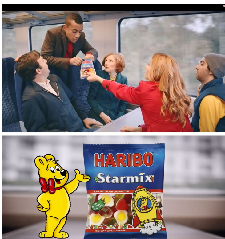
Figure 2. Still images from Haribo's train advert (from https://www.youtube.com/watch?v=dSbJWsIScUE ).

The second advert, from Haribo and lasting 30 s, represented a confectionery (sweets) brand that is affordable with 'pocket money'. The advert is set on a busy commuter train, typical of the UK. The advert depicts a group of adults sat around a table on the train, with a bag of Haribo Starmix in the middle (Figure 2) [43]. There is a mixture of ages, genders, and ethnicities, all of whom are adults. All characters appear to be actors, rather than real-world celebrities. As they share sweets from the packet, the actors' voices have been replaced with the voices of children saying what their favorite Haribo sweets are and why (e.g., "The egg is good, it's all squidgy and soft"). The advert ends with the iconic Haribo jingle, "Kids and grown-ups love it so, in the happy world of Haribo". With the exception of the jingle, there is no accompanying music, and the advert only features the ambient noise of train travel.