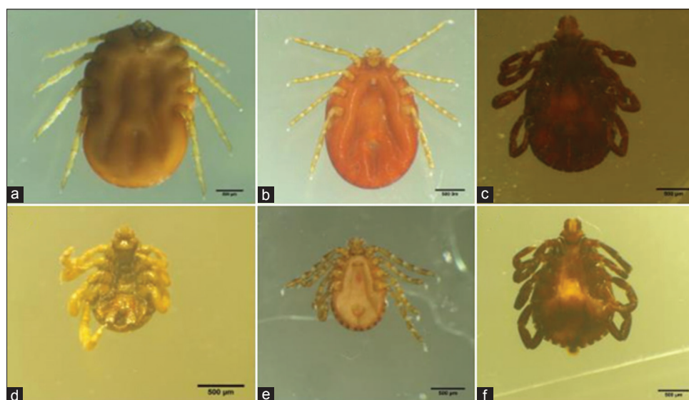
Figure-2: Representative pictures of identified different tick species of cattle during study in the area; (a) Rhipicephalus microplus ventral side of female, (b) Haemaphysalis bispinosa ventral side of female, (c) Rhipicephalus pilans ventral side of female, (d) Rhipicephalus microplus ventral side of male, (e) Haemaphysalis bispinosa ventral side of male, (f) Rhipicephalus pilans ventral side of male. bar 500 µm.

R. microplus = Rhipicephalus microplus , R. pilans = Rhipicephalus pilans , H. bispinosa = Haemaphysalis bispinosa