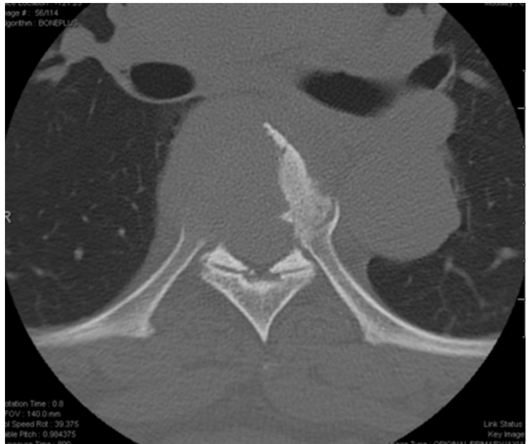
FIGURE 2: Axial CT of T7

Axial thoracic spine computed tomography (CT) demonstrating a lytic bone lesion at the level of T7.