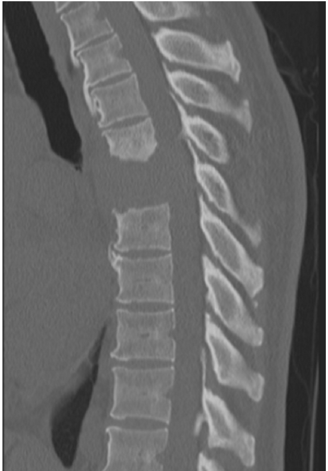
FIGURE 1: Sagittal CT of the thoracic spine

Sagittal computed tomography (CT) of the thoracic spine demonstrating a lytic bone lesion primarily involving the T7 vertebra with some extension cranially into T6 and mild caudal extension into the superior endplate of T8.