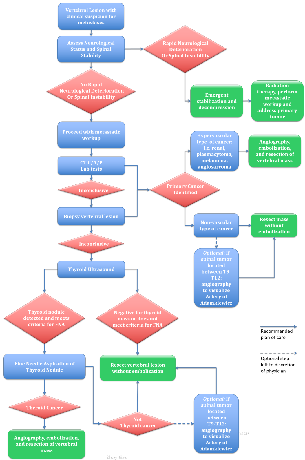
FIGURE 6: Proposed algorithm for vertebral metastases suspicious for metastases

Computed tomography of chest, abdomen, pelvis (CT C/A/P).