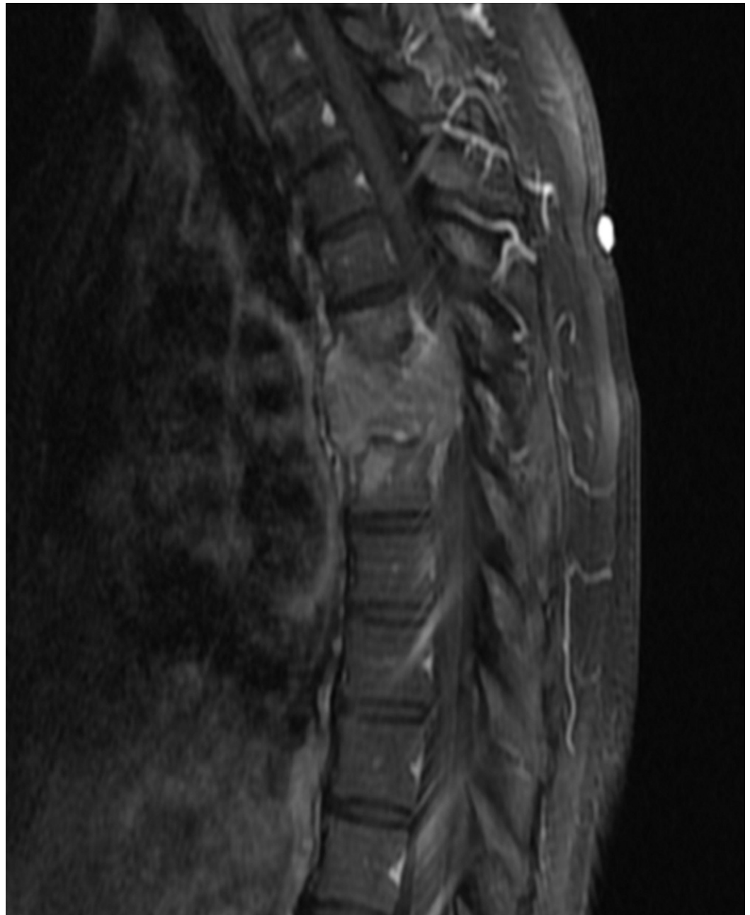
FIGURE 3: Sagittal T1 weighted MRI of thoracic spine with contrast

Sagittal T1 weighted magnetic resonance imaging (MRI) of the thoracic spine with contrast demonstrating a homogeneously enhancing mass lesion in the T7 vertebral body invading superiorly and inferiorly into the intervertebral discs.