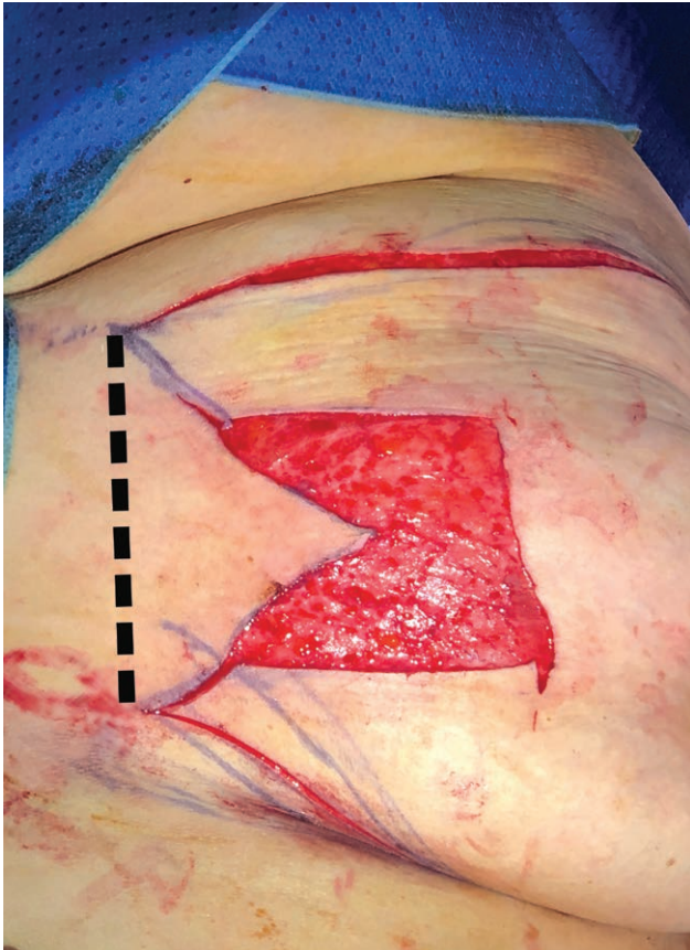
Fig. 1. Modified M-plasty: Marking and de-epithelialization of lipodermal flap component of the right breast. The mid-axillary line is marked by the dotted line.

may be used according to surgeon preference). The inferior marking includes the IMF which is excised. Laterally, the lipodermal flap is incised at its borders and deepened to the anatomical mastectomy plane. This is effectively the lateral flap of the mastectomy. Therefore, the lateral flap is raised in the anatomical mastectomy plane. The breast is mobilized off the pectoralis fascia to complete the mastectomy.