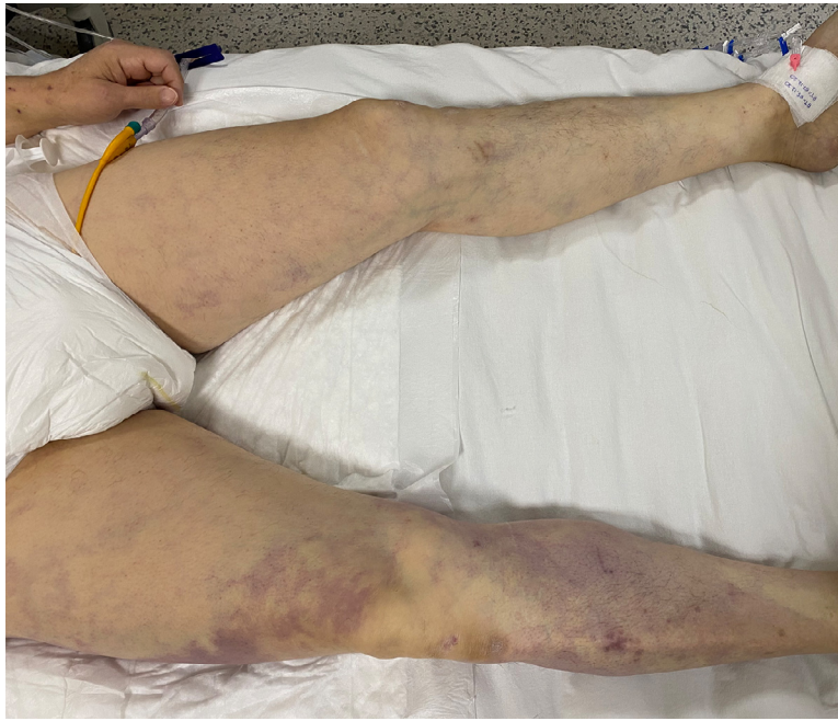
Fig. 1. Clinical appearance of acute limb acute limb ischemia in a hospitalized patient with COVID-19 (Patient #2).