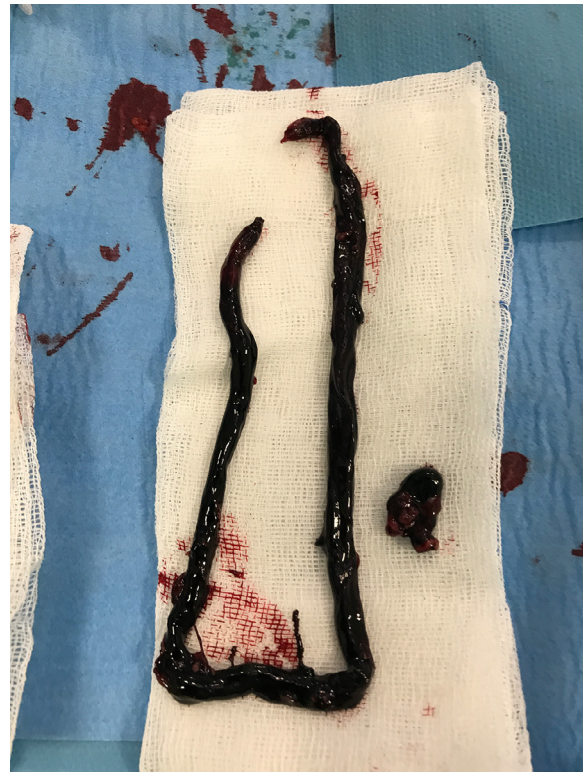
Fig. 3. Thrombus material obtained during surgical thrombectomy procedure performed on Patient #2.

in a tertiary center, a rate similar to previous COVID-19 series, 8,15-17 much higher than general population, 18 and even higher than hospitalized cancer patients. 19 An early report by Bellostta and colleagues 20 estimated an almost 6-fold increase in ALI cases in 2020 compared to 2019. Beyond that, occurrence of arterial thromboembolic events is associated with an increased overall mortality rate among hospitalized COVID-19 patients. 8,15,17 In the present series, 2/6 of COVID-19 patients who developed ALI died.