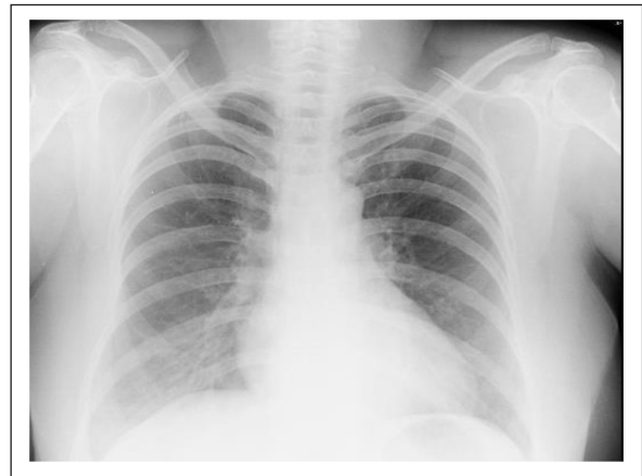
Figure 2. A follow-up chest radiography of the same patient showing near-complete resolution of the lung infiltrates.

A review of medical history and repeat general physical examination was carried out again. Careful examination revealed herpetic lesions with vesicles at the C3 dermatomal level. She was not vaccinated for varicella previously or during her childhood. She also did not suffer from chickenpox illness before this admission. She was not taking any immunosuppressants or steroids. She also had no history of household contact with a similar case or any exposure elsewhere she could remember. She was living with her husband and