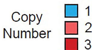
FIGURE 2 Genes with recurrent copy number alterations across all seven external auditory canal (EAC) squamous cell carcinomas (SCC) tumors

NOTCH1, CN = 3; and EAC-SCC6, NOTCH1, CN = 4) suggesting an activated state of NOTCH signaling in these tumors. We also identified three tumors with NOTCH mutations of unknown consequence including EAC-SCC3 which contained a NOTCH2 5' UTR insertion (NM_024408.3:c-29_-21dupCGGCGGCGG), EAC-SCC6 with a NOTCH2 Ser1467Phe (Chr1:120468039, G to A), EAC-SCC7, which contained a NOTCH3 Gly1154Glu (Chr19:15290093, C to T) and NOTCH4 Gly1151Ser (Chr6:32170157 C to T). Collectively, these data demonstrates the importance of NOTCH signaling in EAC SCC and