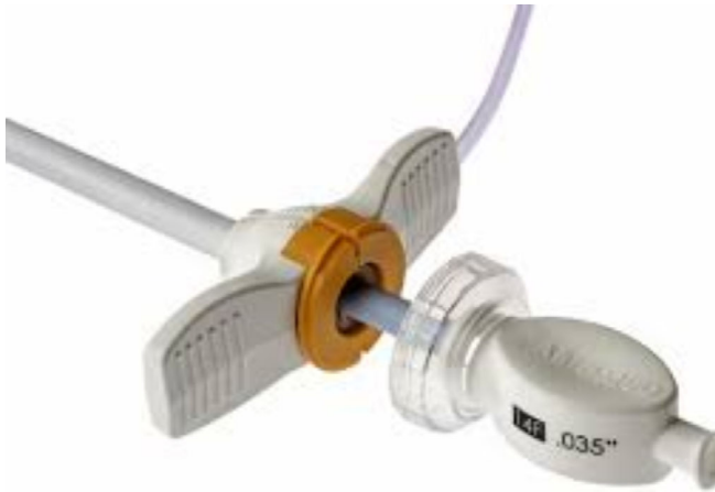
FIGURE 1 Impella insertion sheath