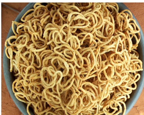
Figure 3 Kokoro after final processing.

coliform organisms, the method as described by Oranusi et al. (2003) was adopted. Colonies on EMB were inoculated into lactose broth in test tubes with inverted Durham (bell) tubes. Incubation was done for 24–48 h at 37 and 44°C. Gas production and/or color change of dye constituted a positive presumptive test. The broth was inoculated onto EMB plates for 37°C incubation. Typical colonies on EMB appearing bluish black with greenish metallic sheen characteristic of E. coli or brown mucoid colonies characteristic of E. aerogenes that are Gram negative and non-spore bearing confirmed the presence of coliform organisms. Isolates were stored on agar slants at 4°C for further characterization.