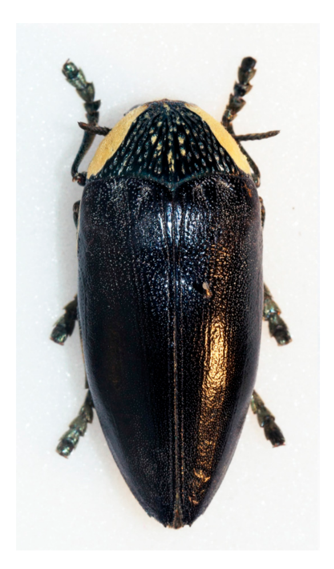
Figure 2. The jewel beetle Sternocera orissa (Buprestidae) is eaten in southern Africa. https://commons.wikimedia.org/wiki/File:Sternocera_orissa_monacha_-_Flickr_-_Bennyboymothman. jpg (Accessed on 20 April 2021). Attribution: Ben Sale from UK, CC BY 2.0, via Wikimedia Commons.