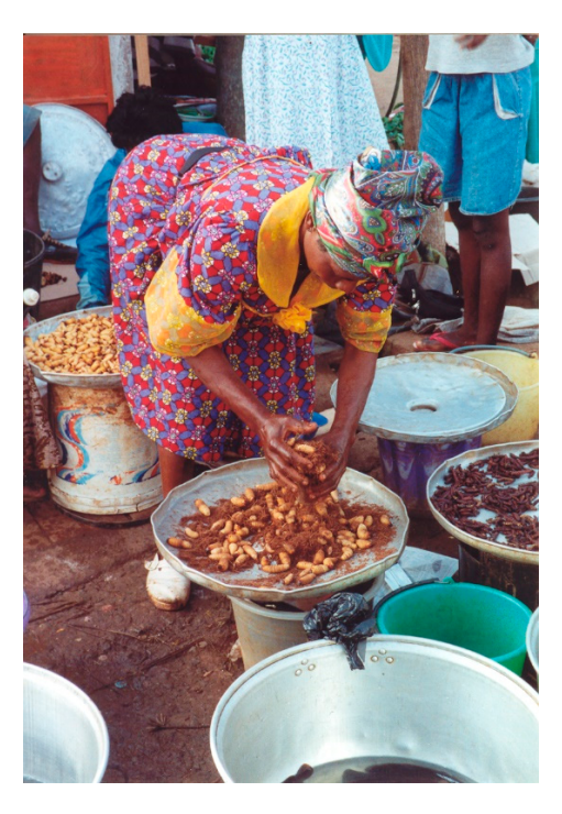
Figure 1. Selling the larvae of the African palm weevil Rhynchophorus phoenicis on the local market in Yaoundé, Cameroon (photo by author).