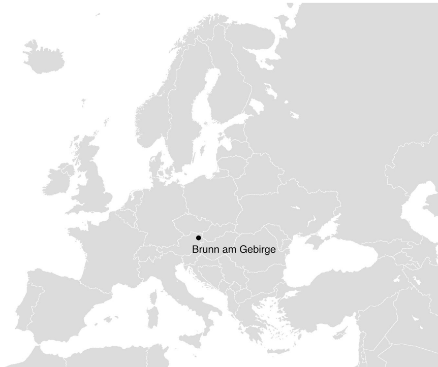
Figure 1. The location of Brunn am Gebirge, Wolfholz site on the map of Europe.

would have adopted farming practices 1 . Evidence of such interactions exists at the Tiszaszólós-Domaháza site in northeastern Hungary, containing interments of individuals of mostly hunter gatherer genetic ancestry buried in a clearly SKC context 2,3 .