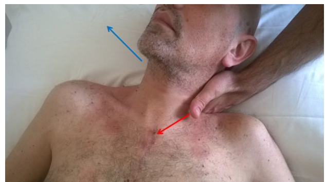
Figure 3 The left hand of the operator fixed the first rib at the level of the supraclavicular fossa of the trapezius muscle, while the other hand grabs the cervico-occipital junction, creating a passive tilt to the left side and a rotation to the right side; this movement needs to stretch the D1 costovertebral joint, limiting parasitic movements and avoiding the involvement of other joints.

Note: The red arrow indicates the direction of the thumb, to the coracoid insertion.