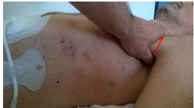
Figure 2 The thumb has to be put under the axilla, with cranial direction toward the coracoid insertion of the muscle, with the force vector being in the oblique axis; once identified the hypertonic area, under the pectoralis major, this position needs to be maintained until myofascial release occurs.

The next step included an HVLA to release the first left rib in an inspiratory attitude (elevation), with the patient being supine. The left hand of the operator fixed the first rib at the level of the supraclavicular fossa of the trapezius muscle, whereas the other hand grabs the cervico-occipital junction, creating a passive tilt to the left side and a rotation