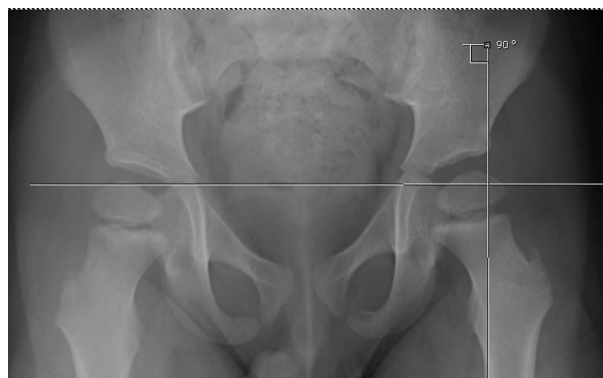
Fig. 1b. The Perkins' line is perpendicular to Hilgenreiner's line at the lateral margin of the acetabulum