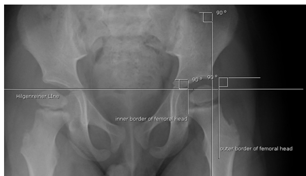
Fig. 1d. The innermost and the outermost border of femoral head's lines of perpendicular to Hilgenreiner's line

the local Ethics Committee. Written informed consent was obtained from all participants. This retrospective study included 62 anteroposterior pelvic radiographs of 31 children (20 boys and 11 girls; mean age 4.2; range 1–14) with spastic CP followed up at our clinic between 2011 and 2013. Patients with CP who had been followed up in our clinic and had radiographs taken were identified using a data search, and those with pelvic radiographs in the hospital's electronic medical records were included in our study. Radiographs were taken with the patient in the supine position, the pelvis symmetric with respect to rotation, and the femurs in the neutral abduction/adduction position relative to the pelvis.