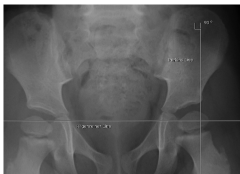
Fig. 1c. The Perkins' line is perpendicular to Hilgenreiner's line at the lateral margin of the acetabulum