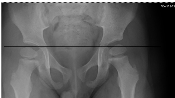
Fig. 1a. Hilgenreiner line (H) is a line between the Y-cartilages of both sides