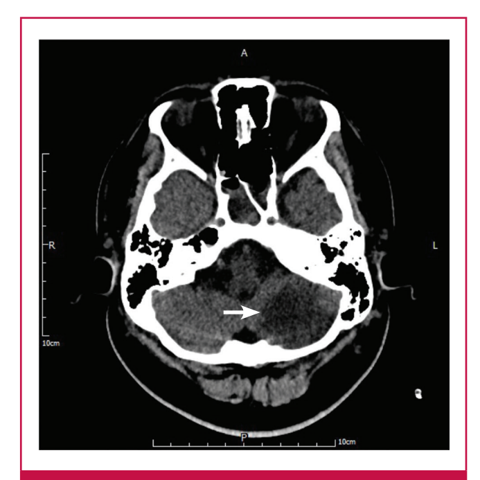
Fig. 2. Hypodense defect indicates acute left cerebellar infarction (white arrow).

When the left ventricular ejection fraction was approximately 50%, the Bi-VAD was weaned (right-VAD: 0.5 l/min; left-VAD: 0.8 l/min). The patient underwent successful Bi-VAD removal,