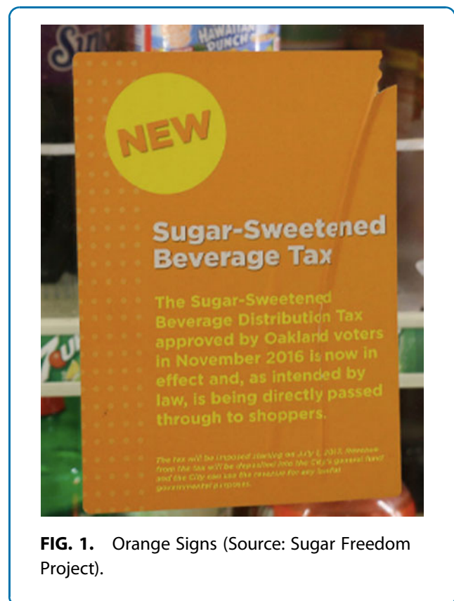
FIG. 1. Orange Signs.

A critical strategy for ensuring equitable funding recommendations is in the appointing of an independent CAB, which, in Oakland, represented the diverse community both in composition and policy implementation, through leadership and partnerships. Engaging local advocacy organizations with existing ties to communities