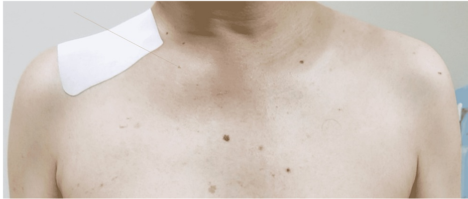
FIGURE 1: Redness, warmth, and tenderness noted in the sternoclavicular joint