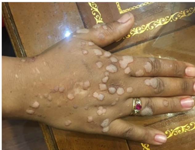
FIGURE 1 Multiple warts on dorsal aspect of the patient's right hand.

A 32-year-old female patient with an unremarkable medical history presented to the clinic with a small, non-tender, and erythematous nodule on the dorsolateral aspect of her left arm, which initially appeared 3 months before. Since then, the nodule had slowly darkened and grown to 1 cm × 1 cm in size. Her history and physical examination were insignificant except for multiple warts on the dorsal aspect of the right hand. (Figure 1). Initially, the patient was suspected of having an infectious cyst and was treated with 10 days of antibiotics. However, she was unresponsive to antibiotics and was evaluated by a surgeon, who diagnosed the lesion as an abscess and surgically removed it.