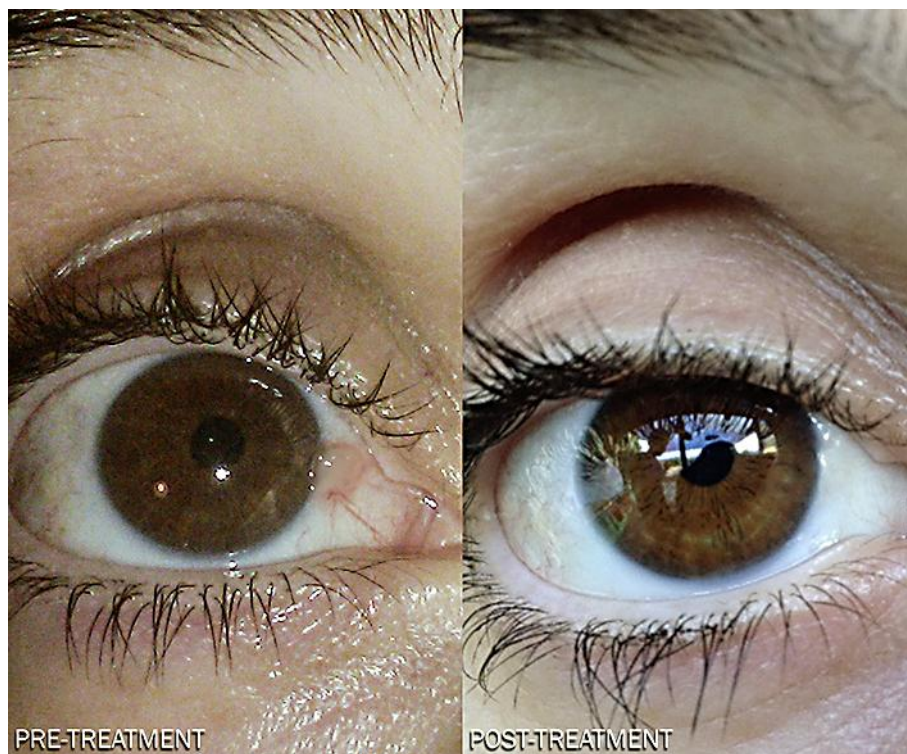
Fig. 1. View 1 of the patient's eye in pre-treatment and post-treatment states.