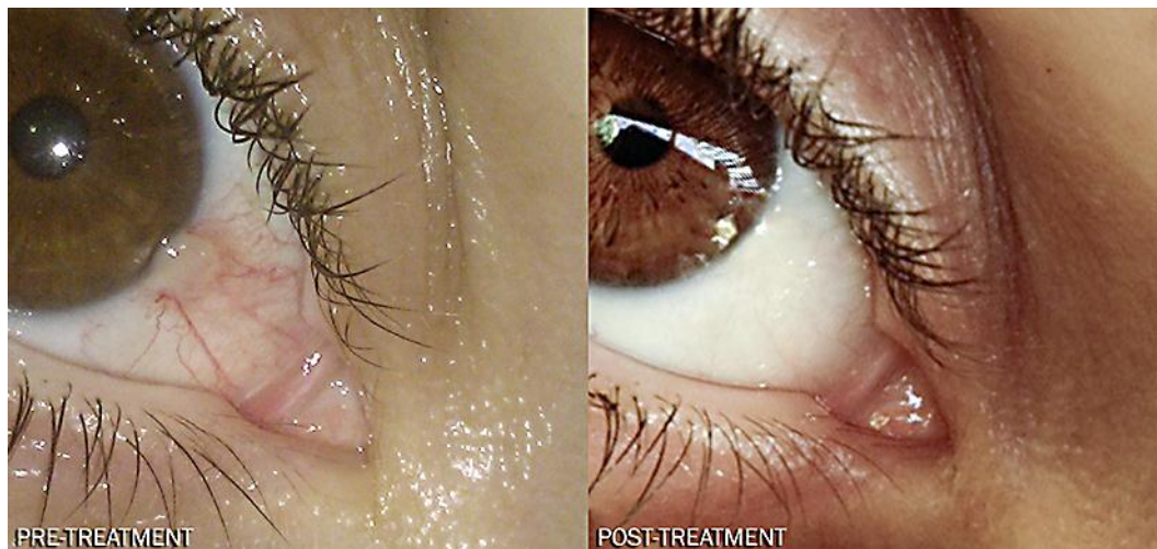
Fig. 2. View 2 of the patient's eye in pre-treatment and post-treatment states.