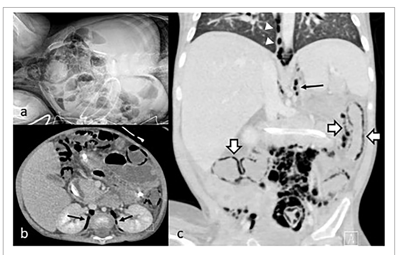
FIGURE 1 | (a) Abdominal x-rays showing IP; (b) coronal CT scan with PRP (arrows); (c) sagittal CT scan showing pneumomediastinum (arrowhead), PRP (arrow), and IP (empty arrows).