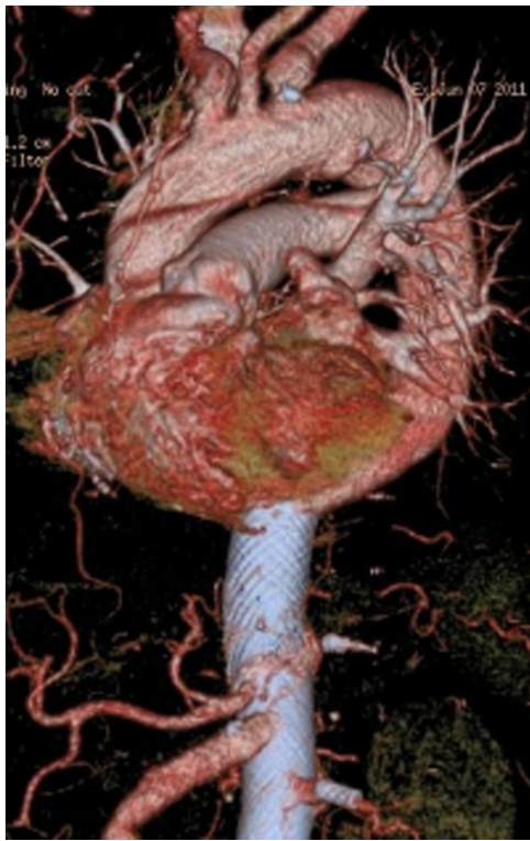
Figure 5 Computed tomography scan: treated thoracoabdominal aortic aneurysm.

Finally, after removing the introducer, the RFA was replaced with a 10 mm Dacron graft (MAQUET GmbH and Co, Rastatt, Germany), and a right to left femoro-femoral bypass was performed (10 mm Dacron graft; MAQUET GmbH and Co). Postoperative course was uneventful and postoperative day 10 CTA showed normal patency of the visceral vessels. The patient was dismissed on postoperative day 12, with 75 mg of clopidogrel and 100 mg aspirin daily oral intake. After 20 months, CTA showed good patency of the visceral vessels with complete TAAA exclusion (Figures 5 and 6).