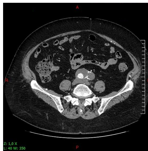
Figure 3 Computed tomography scan: left common iliac artery occlusion and right iliac artery aneurysm.

Ankle brachial index was 0.90 on the right leg and 0.40 on the left leg. Carotid Doppler ultrasound showed a mild bilateral internal carotid stenosis, and dobutamine-echocardiography was negative for cardiac-induced ischemia. After patient-informed consent and hospital ethical committee and Italian Public Health Ministry authorization, an endograft procedure was performed using Cardiatiss ® (Crossmed, Isnes, Belgium) multilayer stents in the aneurysmatic thoracoabdominal aorta. Stent graft sizing and deployment strategy was planned using tomographic aortography (CTA) images reconstructed on a three-dimensional workstation (Sovamed GmbH, Koblenz, Germany). Proximal and distal neck diameter were 30 and 18 mm respectively. Stent oversizing was about 20% (proximal 36 mm; distal 22 mm). A multiple stenting (three grafts) with a 5 cm overlap, using telescopic