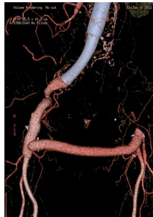
Figure 6 Computed tomography scan: treated thoracoabdominal aortic aneurysm and right to left femoro-femoral bypass.

Treatment of pararenal and thoracoabdominal aortic aneurysms still represent a high risk surgical and endovascular procedure. When open surgery is considered, even in experienced centers, perioperative mortality rates range from 3% to 19%. New technologies have expanded the applicability of endovascular aneurysm treatment to cases with anatomical adverse conditions. But as the indications for mini-invasive techniques have improved, complications and technical failure rates began to rise. 1,8-10 Furthermore, the development of endograft technology and the evolution of branched and fenestrated grafts have necessitated the development of revised reporting standards for EVAR. 11 During the setting