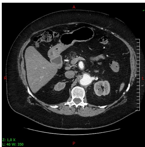
Figure 1 Computed tomography scan: left renal artery stenotic ostium in aneurismal aortic tract.