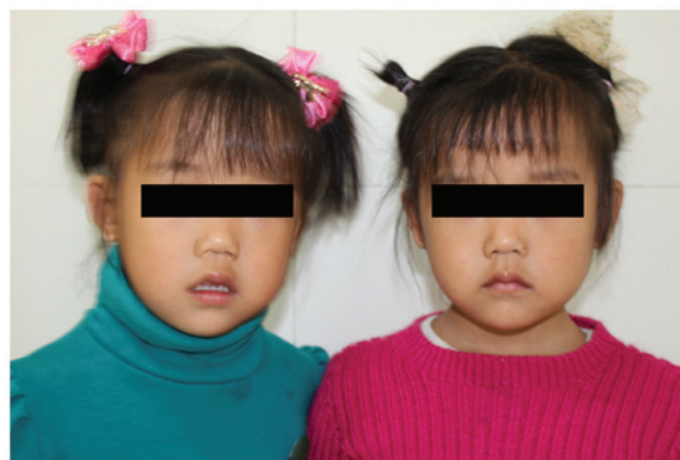
Figure 1. The patient (left, post-operative) and the patient's monozygotic twin sister (right). Neither of them has any distinct facial abnormalities.

Values represent the genotype of the tested allele. STR, short tandem repeat.