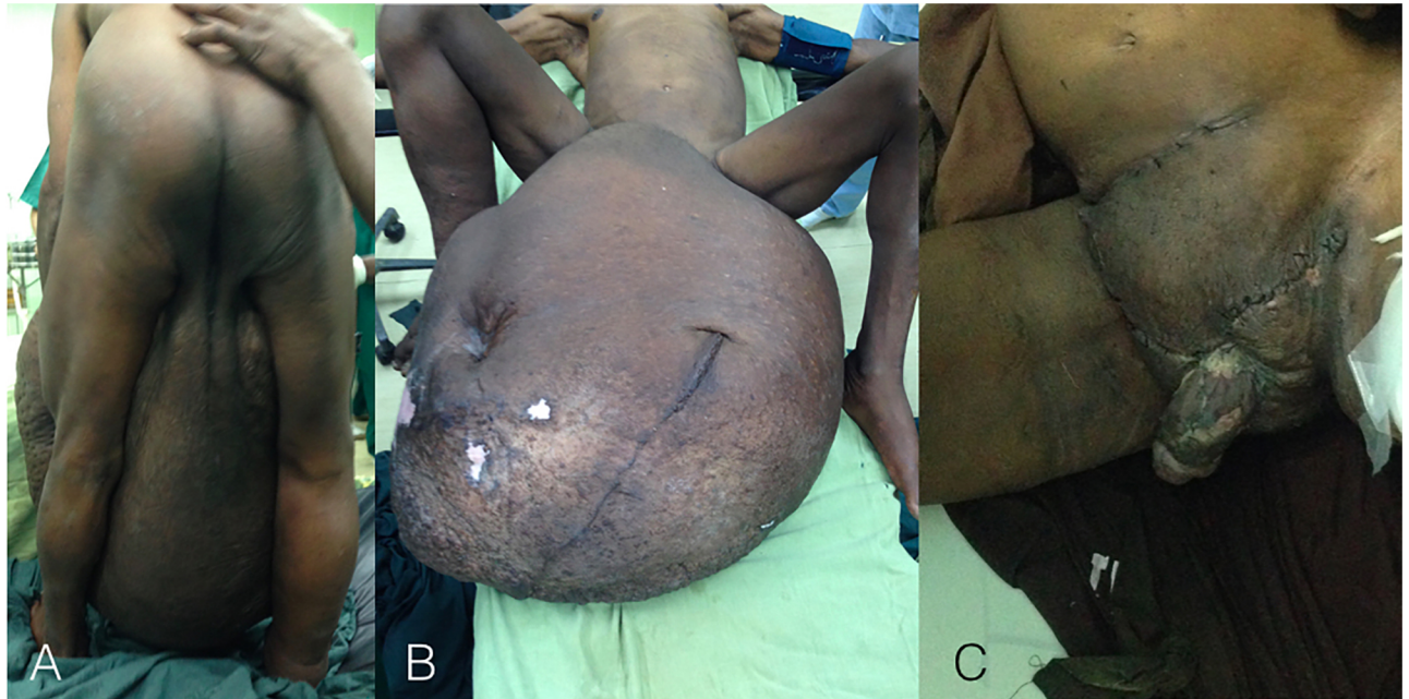
Fig 1. (A) and (B) Preoperative elephantiasis, (C) Postoperative result.

https://doi.org/10.1371/journal.pntd.0005494.g001