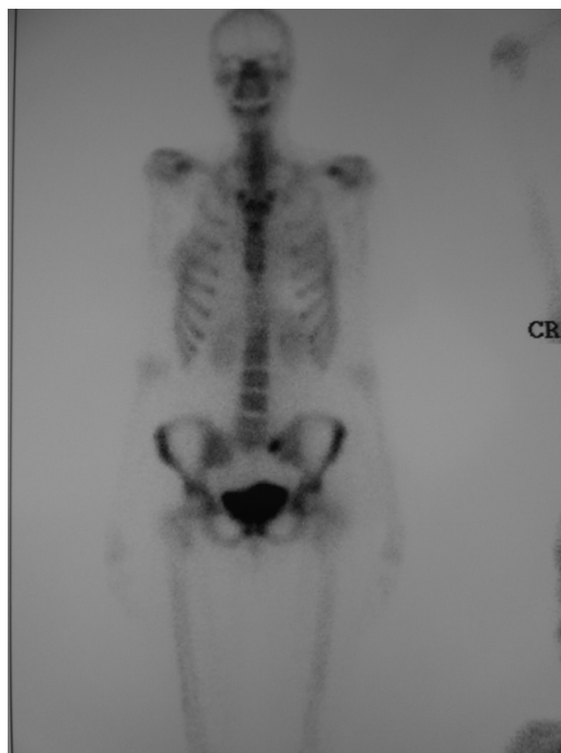
Figure 1 - A bone scan showing the increased uptake in the right sacral region

We recommended that the patient refrain from weight bearing exercises and physical activity for 12 weeks, with a gradual return after appropriate rehabilitation. Nine months