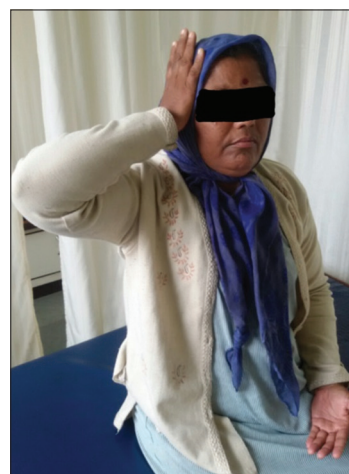
Figure 3: Strengthening exercise-Home exercise protocol