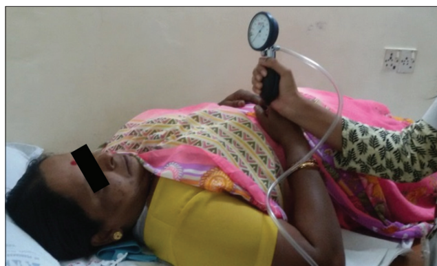
Figure 1: Measuring cervical flexor endurance

In sitting position, subject performed an isometric push against the hand to strengthen the neck. Subject was told to hold the left palm against the left side of the head. Push the left hand against the head while also pushing your head toward your left hand at about half strength. Hold for 30 s. The same was repeated with the right hand on the right side of the head and using either hand, with the back of the head, and the forehead. This was repeated 5 times.