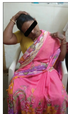
Figure 2: Stretching exercise-Home exercise protocol