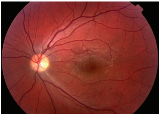
FIGURE 2: Colour photograph of left fundus 1 month after initial artery occlusion showing marked resolution in signs and sclerosis of vessel.