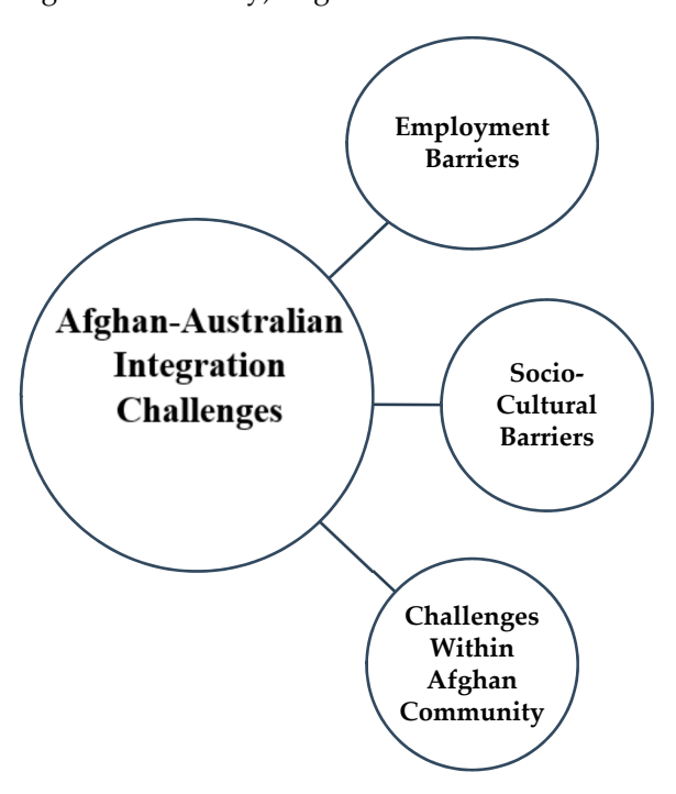
Figure 2. Main themes that emerged from qualitative data.

Undertaking a bottom-up approach in thematic analysis, the researchers started with transcriptions, going through the data and noting similarities in the interviews. In this regard, dozens of simple codes were created and, in following step, they were grouped together to find patterns in the data. To do this, researchers drew a map of codes to understand the relationship between them in order to create themes. Finally, three main themes emerged from the qualitative data, indicating the main challenges for former Afghan refugees in Australia: employment barriers, socio-cultural barriers, and challenges within the Afghan community in Perth. These challenges can be categorised under integration markers and means, as well as social connection (within and outside the Afghan community). Figure 2 shows the themes.