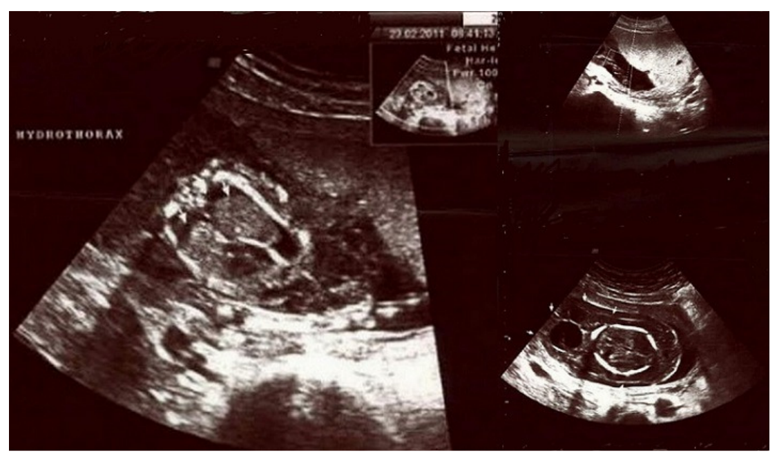
Figure 1: Cystic hygroma, fetal hydrothorax and abnormal umblical artery pulsed Doppler