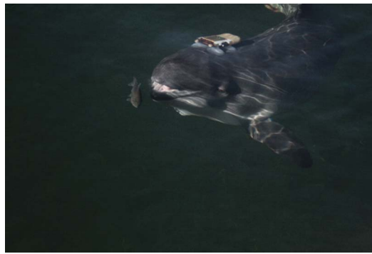
Figure 1. A porpoise using echolocation to find and capture a fish at the Fjord and Belt research facility where the research by Wisniewska et al. was conducted. The porpoise is wearing a tag that records the outgoing clicks and echoes returning from objects in this environment.

Perhaps physiology constrains how much transmit or receiver gain can change with time. On the other hand, thinking ecologically, perhaps it is a hint that dolphins keep the level of their click constant at the target. Why would dolphins control sound level at the target rather than loudness of the echo as they hear it? Most fish are only able to hear low frequency sound, but some fish (such as herring) are able to hear high frequencies. Indeed, shad swim away from high frequency clicks, which could suggest that these fish evolved specialized hearing in order to escape echolocating predators ( Wilson et al., 2011 ). When killer whales feed on prey that might be able to hear their echolocation clicks, they use more cryptic echolocation than when feeding on deaf prey. Perhaps dolphins also adjust the level of their clicks as they approach some prey to reduce the risk that prey may hear and avoid them. The way dolphins reduce click level to maintain a constant level at the prey would be just right for this problem, perhaps requiring them to perform the rest of the gain control by changing the sensitivity of their hearing.