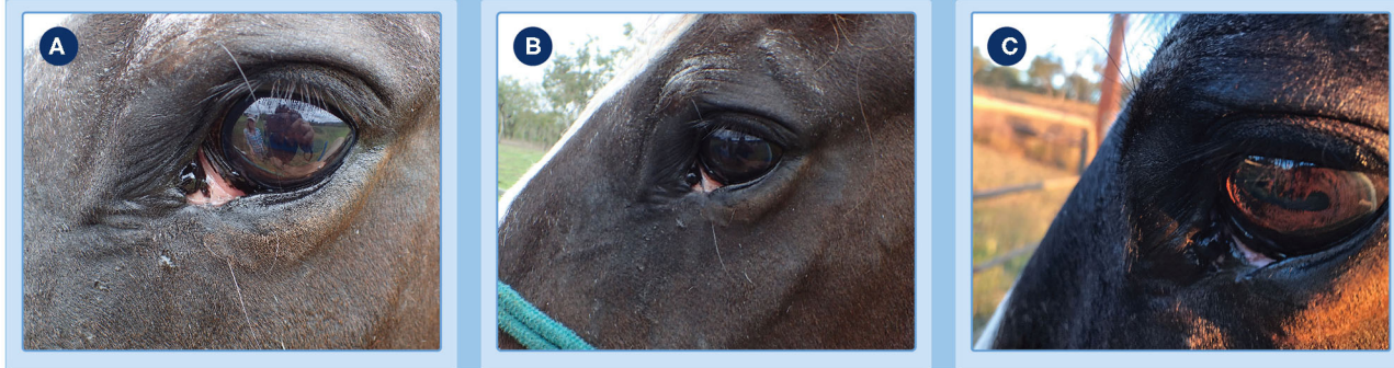
FIGURE 4 | Progression of clinical response of a peri-ocular SCC to treatment with tigilanol tiglate. Healed treatment site at day 73 (A,B) and day 189 (C) showing no recurrence of the tumor.