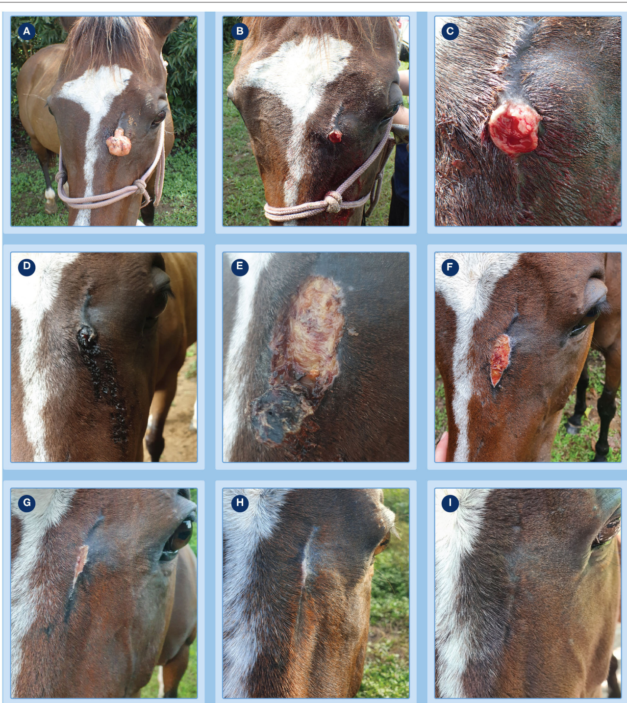
FIGURE 1 | Progression of clinical response of a fibroblastic sarcoids to treatment with tigilanol tiglate. (A) the pedunculate sarcoid prior to treatment; (B,C) treatment site after pedicle had been surgically excised to allow measurement of sarcoid base for calculation of dosing and immediately prior to injection with tigilanol tiglate (D) the development of bruising and haemorrhagic necrosis by 24 h after injection; (E) tumor slough at day 6; (F–H) progression of healing at days 15, 27, and 36; (I) no evidence of sarcoid recurrence at the treatment site by day 93.