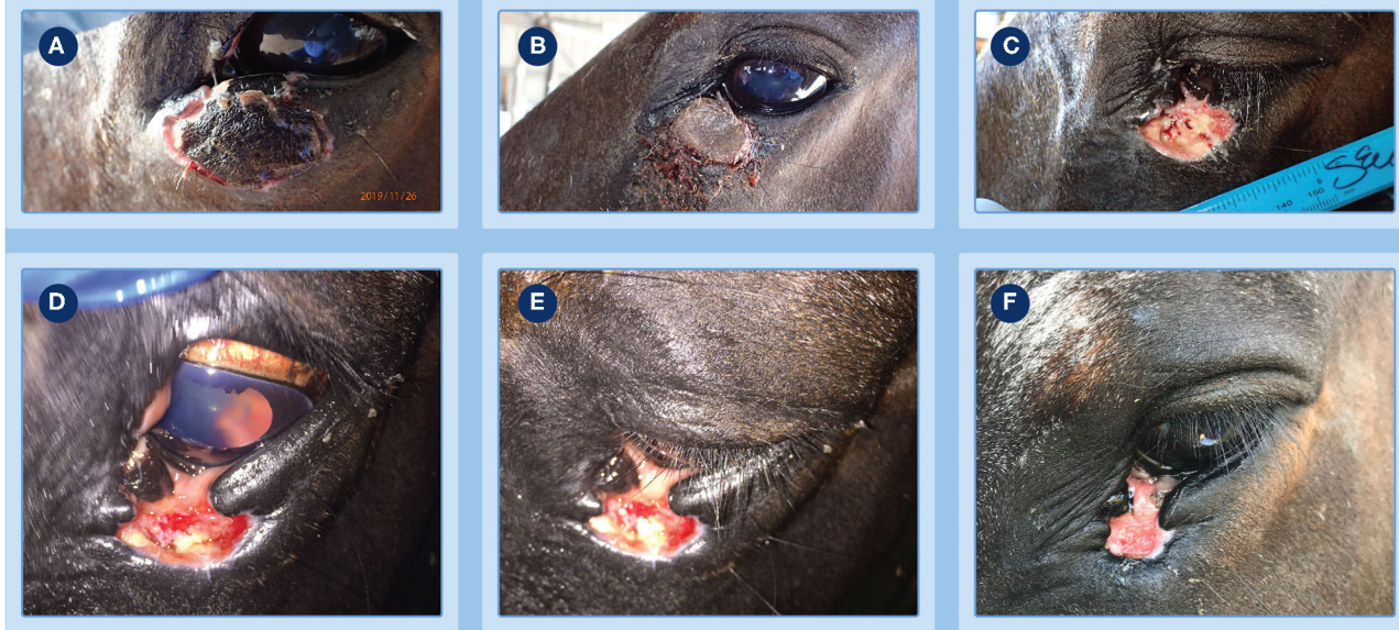
FIGURE 3 | Progression of clinical response of a peri-ocular SCC to treatment with tigilanol tiglate. (A,B) clear demarcation of the necrotic tumor mass at days 8 and 16, respectively; (C) underlying wound bed exposed following slight manual pressure to the eschar at day 16; (D,E) examination of the eye at day 19 show it to be normal and unaffected with a well-dilated pupil; (F) healing at the site by day 27.