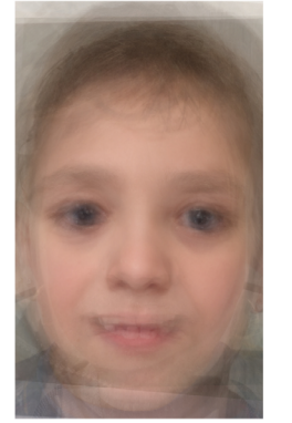
n = 13 (9M, 4F) mean age 18.3y