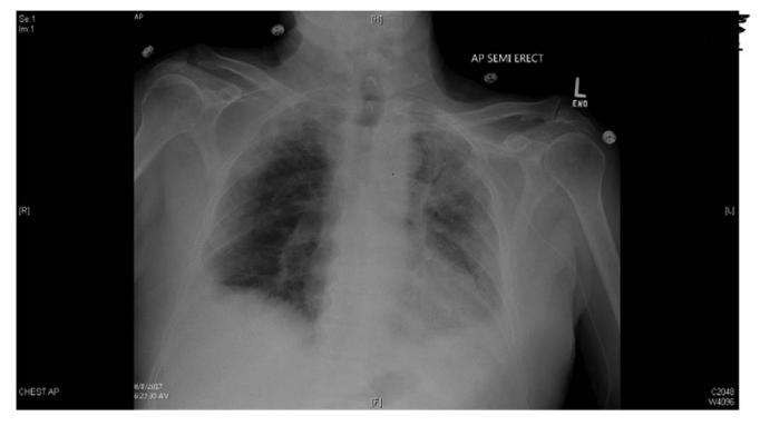
CXR after the treatment