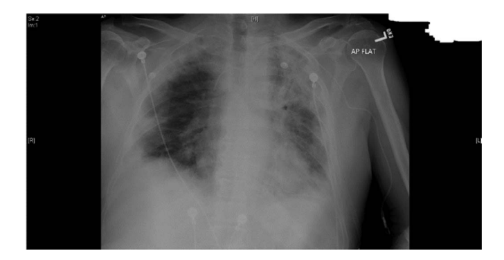
CXR Before the treatment

Laboratory studies revealed WBC of 5700/mcl, with 11% of eosinophils, hemoglobin level of 9.9 g/dl, platelet count of 364,000/mcl and creatinine level of 1.63mg/dl. His CRP level was 34.1, ESR of 25 with a total CK level of 92. ABGs showed a PH of 7.51, PCO2 of 30 and PO2 of 63. He was admitted and placed on a high flow oxygen. Daptomycininduced pneumonitis was suspected. Bronchoscopy was done with BAL showing 28% eosinophils. He was continued on steroids with significant improvement. He was discharged home with a long taper and less oxygen requirements. Reevaluation after 4 weeks showed significant improvement of dyspnea and no more need for supplemental