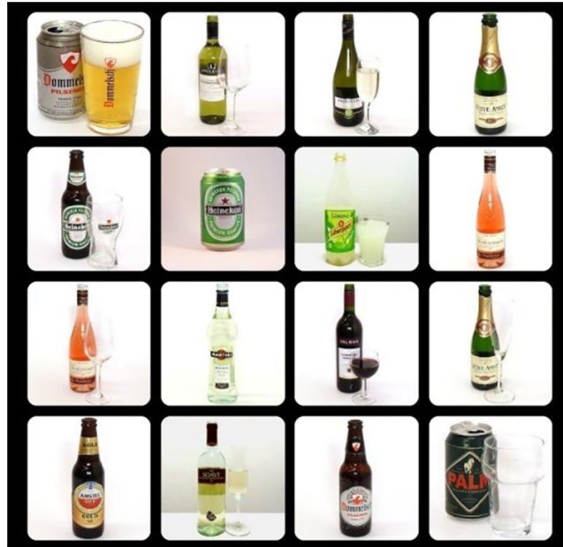
Fig 1. Example of an alcohol distractors trial of the VST.

https://doi.org/10.1371/journal.pone.0228272.g001