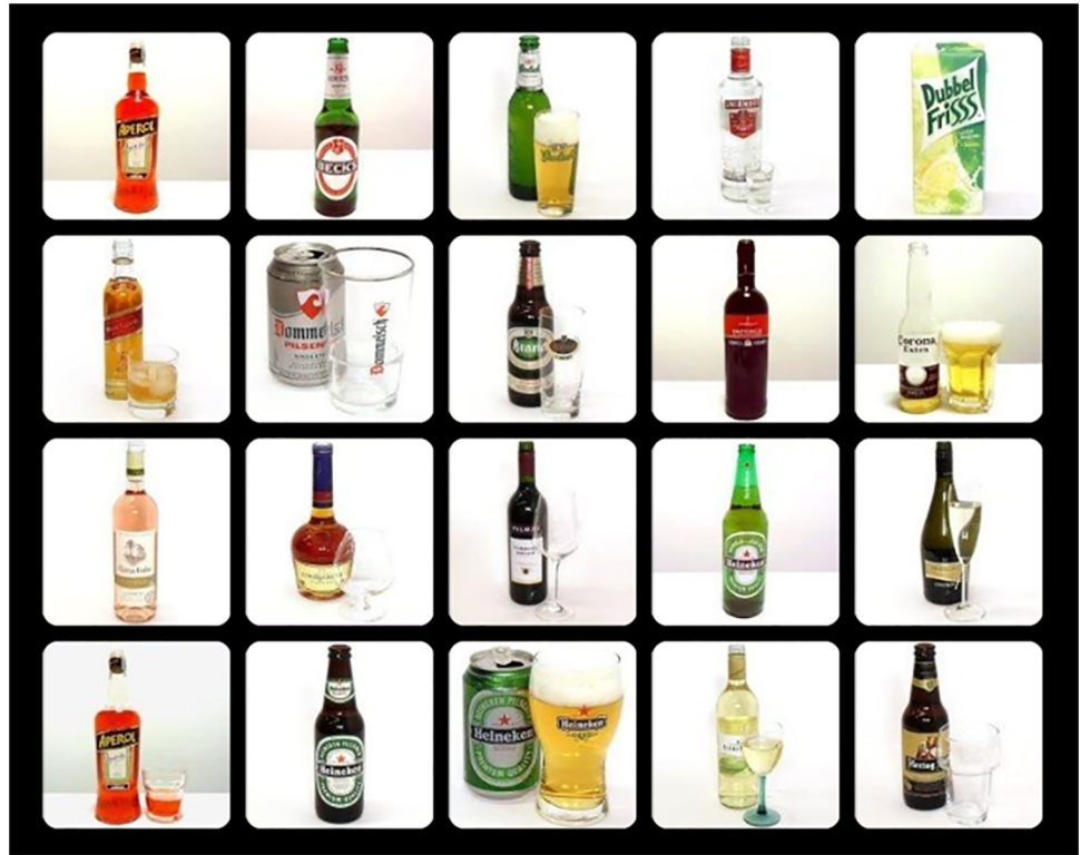
Fig 2. Example of an alcohol distractors trial of the OOOT.

https://doi.org/10.1371/journal.pone.0228272.g002