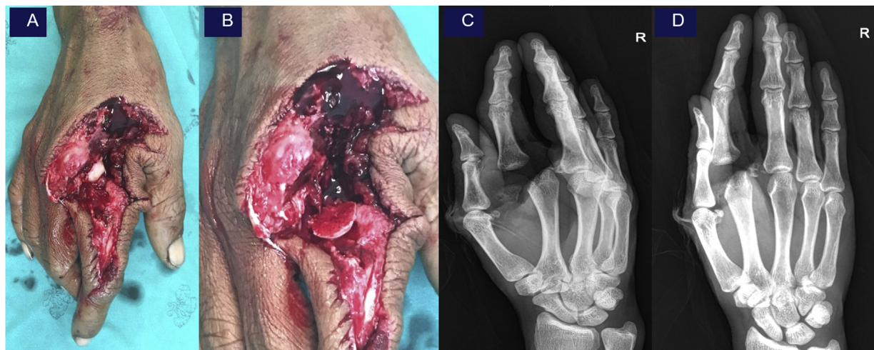
Fig. 1. Pre – operative examination showing nearly amputation of right index (Fig. 1A). Radial of digital artery, vein and nerve of index completely tear with the articular surface of metacarpal head fracture (Fig. 1B). The radiographs show fracture dislocation of the head of the second metacarpal with articular involvement fracture 25% in oblique view (Fig. 1C) and AP view (Fig. 1D).