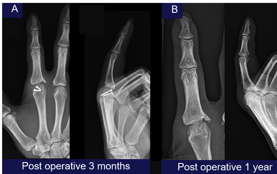
Fig. 4. The radiographs showed the union of intraarticular fracture at 3 month follow up (Fig. 4A) and 1 year follow up (Fig. 4B).