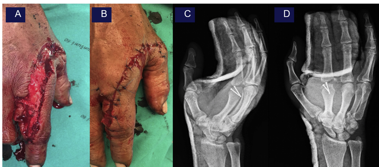
Fig. 3. Intra-operative repair collateral ligament complex (Fig. 3A-B) and post – operative showing post-operative x-ray oblique view (Fig. 3C) and AP view (Fig. 3D).