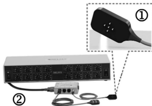
Figure 2. dEMG sensor (1); Delsys Bagnoli amplifier (2).

Surface EMG data were collected using the Delsys dEMG system (Delsys Inc., Natick, MA, USA). The dEMG system (Figure 2) consisted of a 16-channel amplifier and a 4-channel EMG electrode (dEMG sensor, Delsys Inc., Natick, MA, USA). The EMG signals were sampled at 2 kHz with a gain of 1000 and band-pass filtered (20–450 Hz) through a Delsys Bagnoli amplifier and NI USB 6251 DAQ (National Instruments, Austin, TX, USA). The dEMG sensor consisted of five cylindrical blunt-ended pins 0.5 mm in diameter, with an interelectrode spacing of 5 mm, providing 4 channels of surface EMG data. The dEMG sensor was taped in place over the surface of the FDI muscle after the skin was prepared by cleansing using an alcohol swab and moistening with a dilute saline solution. Initially, participants were asked to perform a maximum contraction pushing their index finger against a rigidly mounted force sensor for approximately 3 s; they were then allowed to rest for 2 min. They were then asked to perform 3 repetitions of a 30 s contraction at 30% of their maximum following a trapezoid force biofeedback channel. This comprised of a quiescent period, a 3 s ramp up period, a 30 s isometric hold, a 3 s ramp down period, and a final quiescent period with a 2 min rest between repetitions, the dEMG sensor remained attached to the subject for the duration of the experiment.