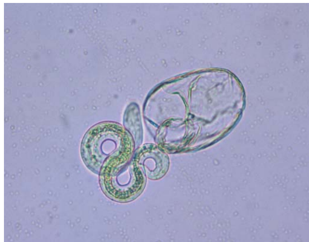
Figure 1. Viable Baylisascaris procyonis larvae demonstrating intact membrane and impermeability to methylene blue. Original magnification ×40.

To determine the ability of eggs to withstand freezing temperatures, 150 µL each of embryonated eggs at a concentration of 100 eggs per µL were added to ten 1-mL polypropylene tubes of sterile water. The tubes of eggs were exposed to an environment of -15°C. Every 30 days, 1 tube was removed and thawed at room temperature. Viability was evaluated by using both motility and methylene dye