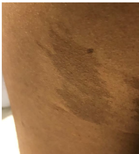
Fig. 1. Café-au-lait macule.